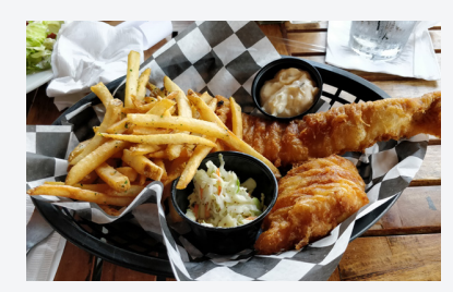
BOWEN'S ISLAND RESTAURANT

205 E Bay Street, Charleston, SC 29401 (843) 853-8600