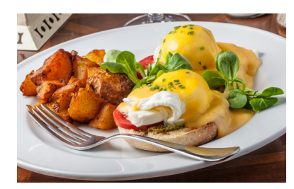
BLACK MAGIC CAFE

434 King Street Charleston, SC 29403 (843) 727-0090