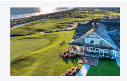
OCEAN COURSE AT KIAWAH

1000 Ocean Course Drive, Johns Island, SC 29455