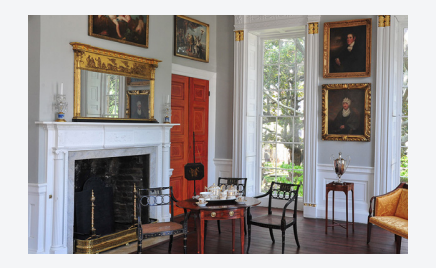
NATHANIEL RUSSELL HOUSE