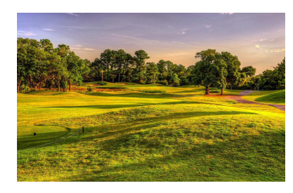
CHARLESTON NATIONAL GOLF COURSE

5757 Palm Boulevard, Isle of Palms, SC 29451