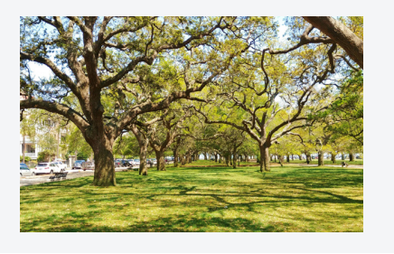
WHITE POINT GARDENS & BATTERY PARK

1595 Highland Avenue, Charleston, SC 29412