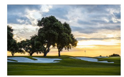
PATRIOTS POINT LINKS

1000 Ocean Course Drive, Johns Island, SC 29455