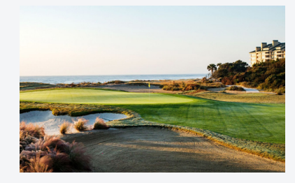
THE LINKS COURSE AT WILD DUNES

1 Patriot's Point Road, Mt Pleasant, SC 29464