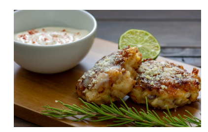
AMEN STREET FISH & RAW BAR

193 King Street, Charleston, SC 29401 (843) 579-4997