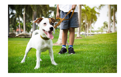
JAMES ISLAND COUNTY PARK

30 Mary Murray Drive, Charleston, SC 29403